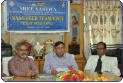
Peer Team Chairman with members

The National Assessment and Accreditation Council visited our college between 10-12 October 2012. After inspecting facilities and amenities in the departments, they awarded the college with a 'B' Grade