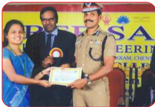
A certificate and cash prize for Faculty for producing 100 % result .