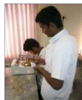
Microbiological analysis at Biotechnology Department

Description: India is one of the largest broiler producers in the world. Huge quantities of poultry wastages are generated and dumping of these wastes causes several environmental pollution problems. One of the serious problems is, it also serves as a nutritional source for the growth of several pathogenic bacteria and thereby causes disease outbreaks. This work addresses this environmental issue through enumeration, isolation and identification of microorganisms from the dumping sites of poultry wastages. Samples were collected from five different regions and bacterial isolates obtained were then purified into pure culture and identified based on their morphological, cultural and biochemical tests by standard microbiological procedures. The isolated pathogenic organisms were Vibrio Choleare , Vibrio Parahaemolyticus , Salmonella Typhi , Shigella dysenteriae , Shigella sonnei and Klebsiella pneumonia . The colonization of pathogenic bacteria in these dumping sites is highly hazardous to the environment and needs prompt disposal system.