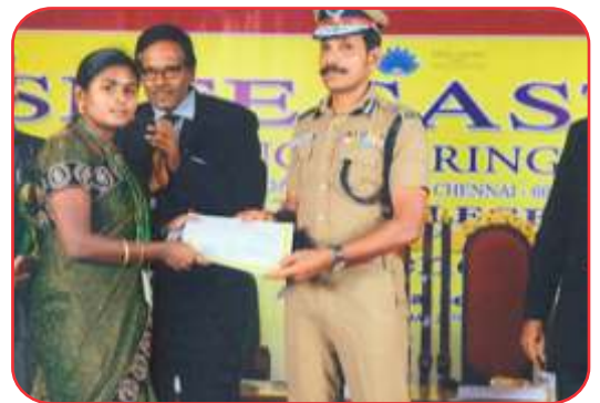
Cash Prize for Paper presentation & Journal Publication.