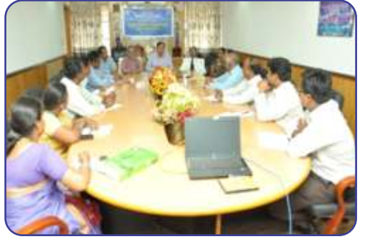
NAAC Peer Team Exit Level Meeting in progress