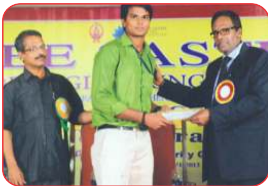
A certificate and cash award for Department Topper.