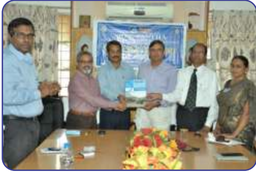
The Peer Team members giving the NAAC report to the Principal